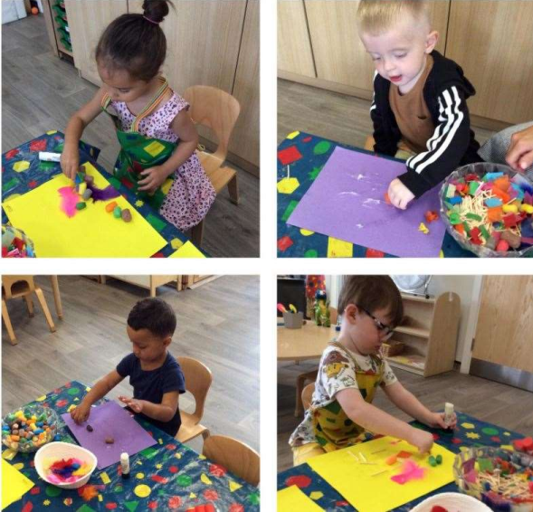
OUR 2-YEAR-OLDS IN THE WILLOW ROOM HAD FUN STICKING & GLUING