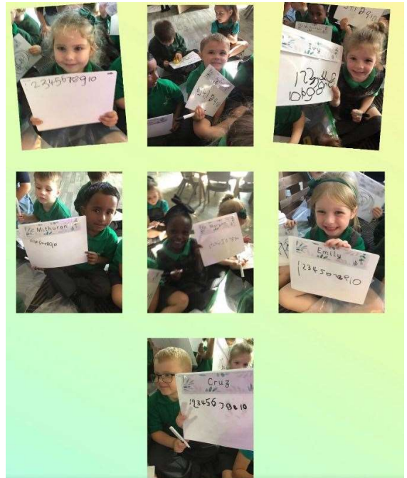
MISS MILES' RECEPTION CLASS WERE WORKING ON NUMBER FORMATION. WELL DONE!