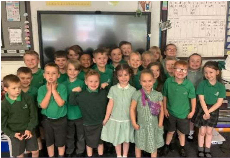
MS BARROW'S NEW CLASS 2B