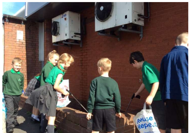
OUR ECO COUNCIL TEAM OUT LITTER-PICKING ON THE SCHOOL GROUNDS FOR THE BIG CLEAN UP.